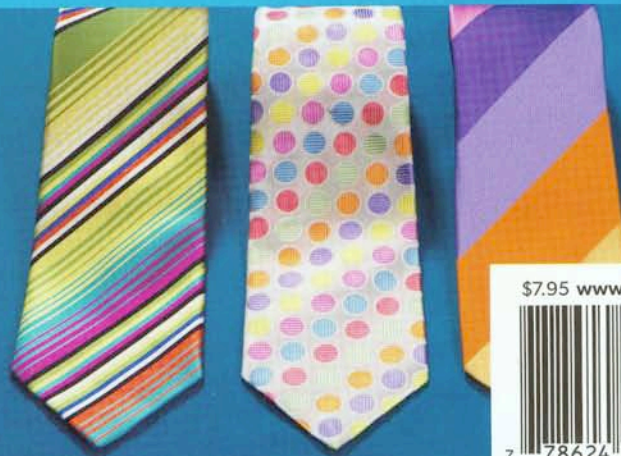
HOLT RENFREW PAGE 10