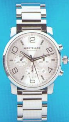
MONTBLANC PAGE 45