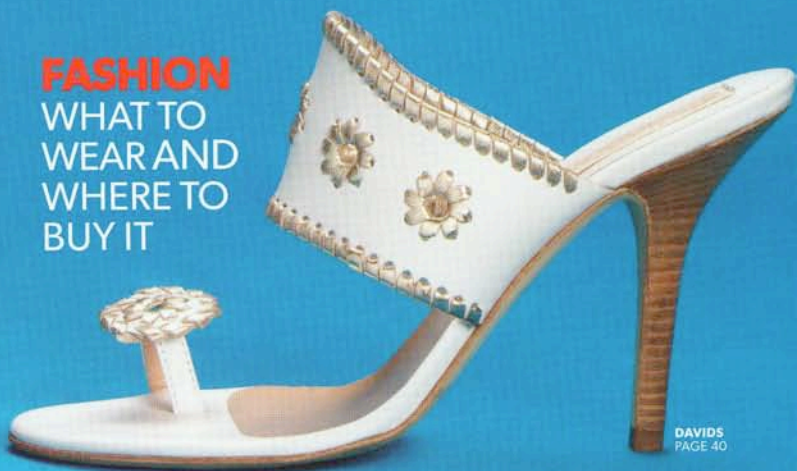
DAVIDS PAGE 40

FASHION WHAT TO WEAR AND WHERE TO BUY IT