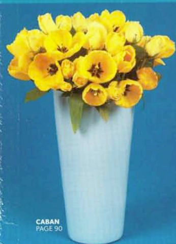
CABAN PAGE 90

GOOD STUFF CHEAP WHERE TO FIND DEALS AND STEALS