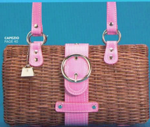
CAPEZIO PAGE 40

FASHION WHAT TO WEAR AND WHERE TO BUY IT